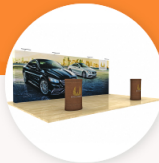
20ft Milan-Wave Tube Fabric Straight Package $2,939.00