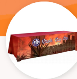
6 Ft Table Throw Dye 4- sided sublimation over entire throw $398.00