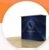
Large Rectangle Counter $439.00 – $1,790.00