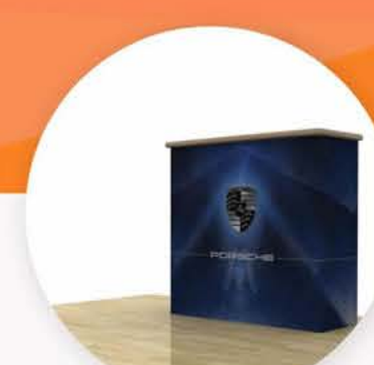
Large Rectangle Counter $439.00 - $1,790.00