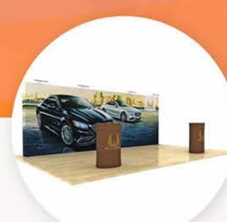
20ft Milan-Wave Tube Fabric Straight Package $2,939.00