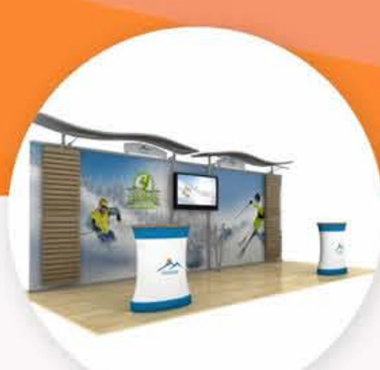
20ft Timberline Kit with Straight Fabric Sides, Monitor Mount, and Slat Walls Call for Price