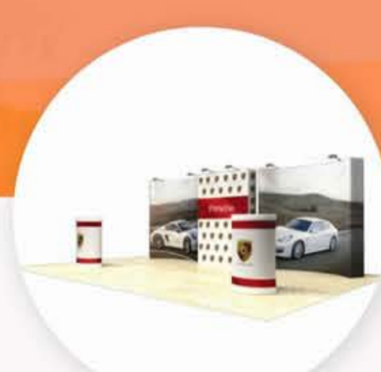
20ft Big Fabric Curved Package $3,590.00