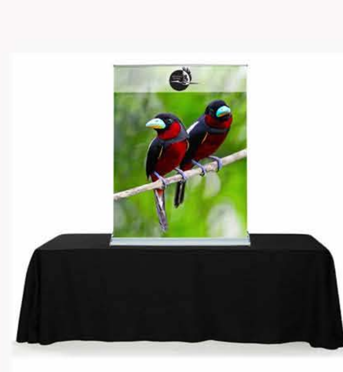
TABLE TOP DISPLAYS